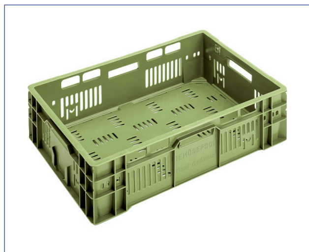
Ref. V-6416 - 32 lit. - 1.560 gr. ext. 600 x 400 x 160 mm int. 565 x 365 x 155 mm