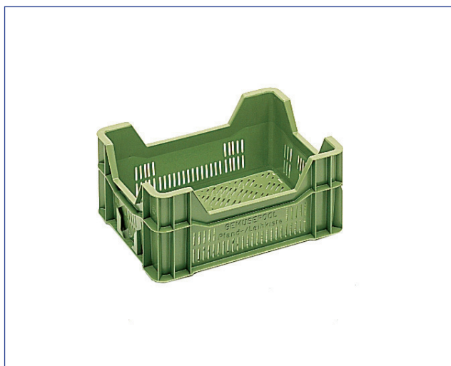
Ref. V-4310-15 - 10 lit. - 540 gr. ext. 400 x 300 x 100/150 mm int. 365 x 265 x 105/145 mm