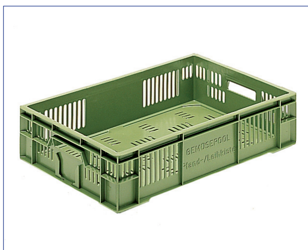
Ref. V-6413 - 26 lit. - 1.340 gr. ext. 600 x 400 x 130 mm int. 565 x 365 x 125 mm