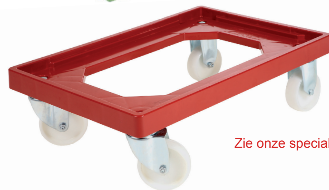
Zie onze speciale folder DOLLY & ROLLERS