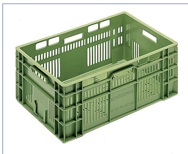
Ref. V-6423 - 46 lit. - 1.980 gr. ext. 600 x 400 x 230 mm int. 565 x 365 x 225 mm